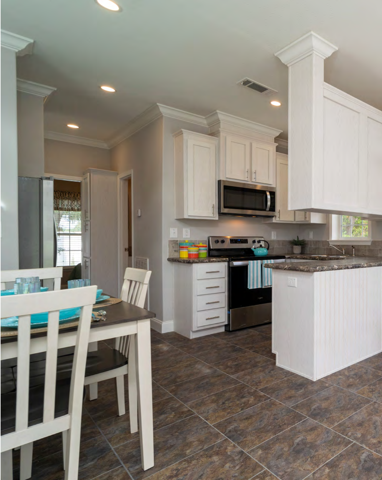
Modern and Well-Appointed