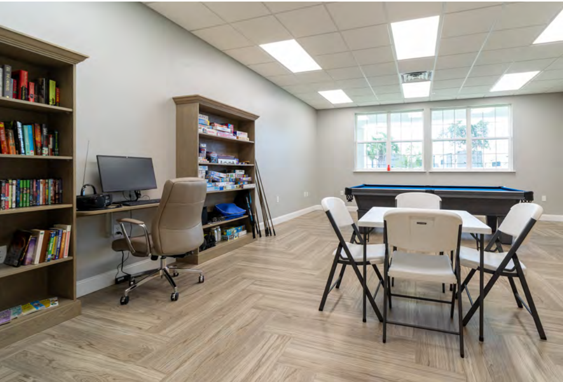
Game Room with Pool Table