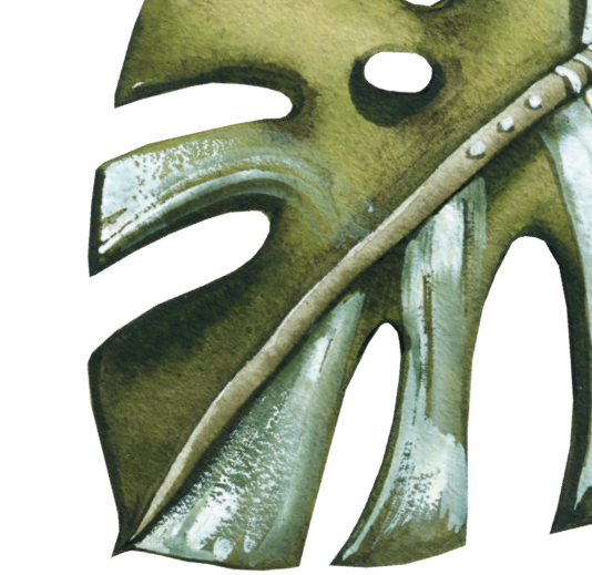
Comfortable and Airy