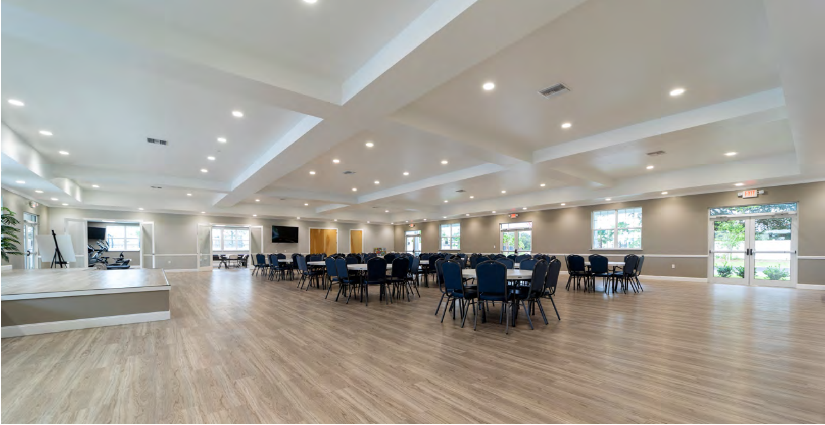
Indoor Dining Hall

Intended and occupied by persons 55 years of age and older.